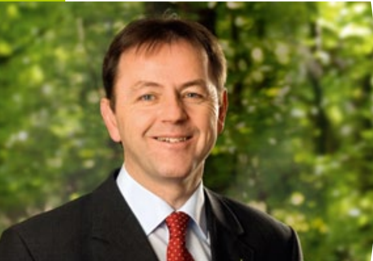
Federal Minister of Agriculture, Forestry, Environment and Water Management DI Niki Berlakovich