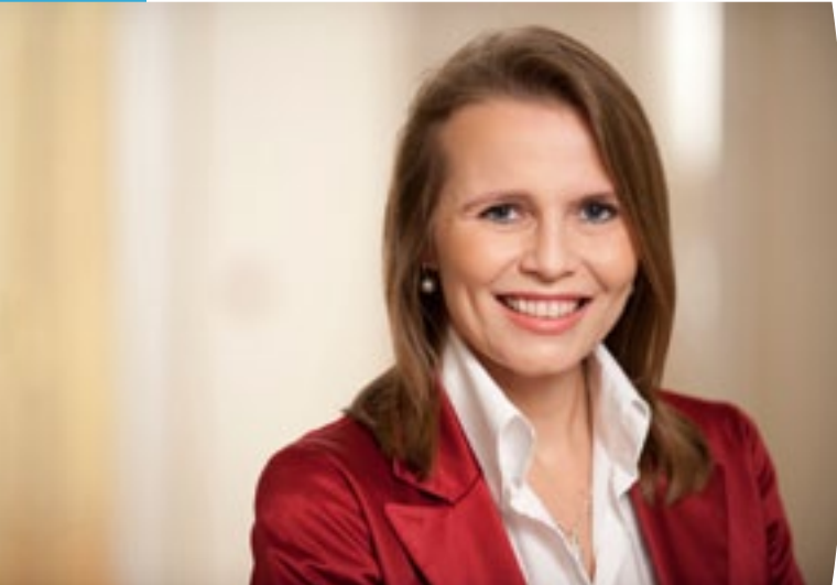
Austrian Federal Minister of Science and Research Dr. in Beatrix Karl